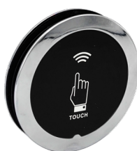
M-501Q Embedded type