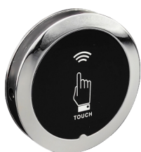
M-501 Exposed type